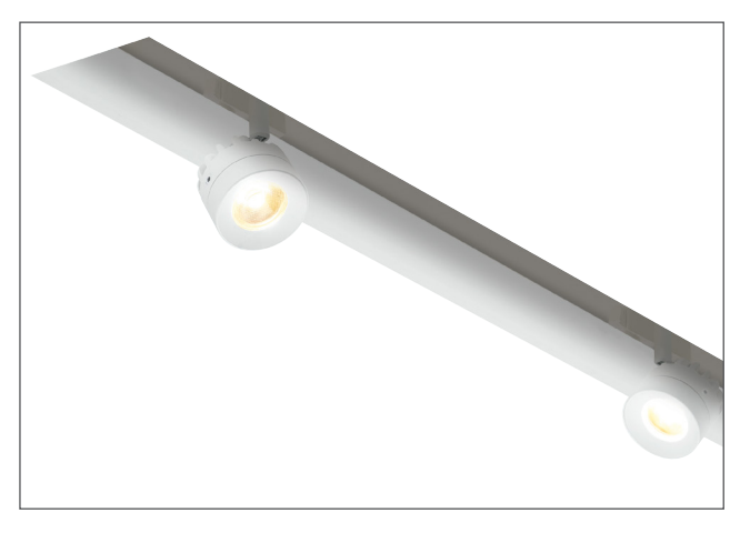
MERGE shown flangeless