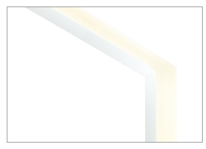
MERGE shown flangeless

Max run length is 80' for the channel; typical max run length is 40' for the low-voltage bus which can be powered from both sides for a total of 80'; system wattage will impact max run length