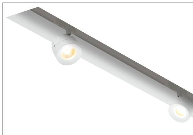
MERGE shown flangeless

Notes: Typical max run length is 40' for the low-voltage bus which can be powered from both sides for a total of 80'; system wattage will impact max run length