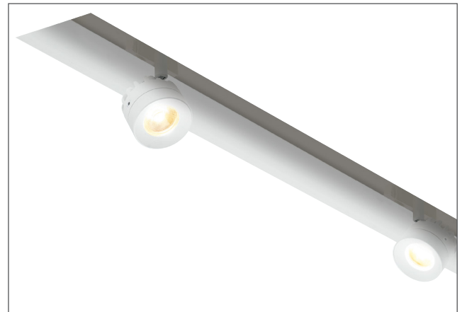
MERGE shown flangeless

Notes: Typical max run length is 40' for the low-voltage bus which can be powered from both sides for a total of 80'; system wattage will impact max run length