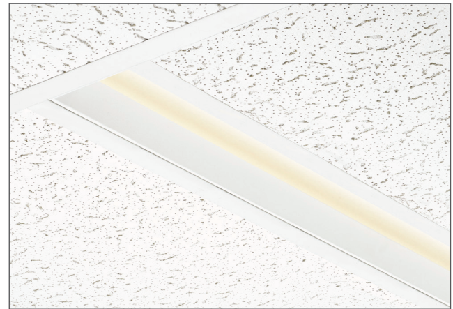
MERGE shown lay-in

Notes: Typical max run length is 80' for the channel; typical max run length is 40' for the low-voltage bus which can be powered from both sides for a total of 80'; system wattage will impact max run length