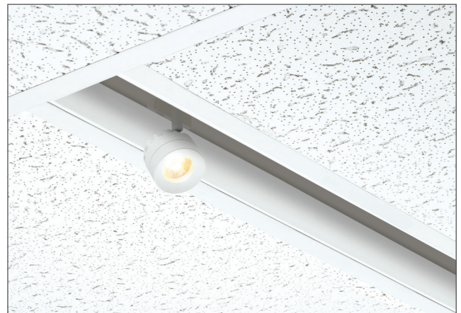
MERGE shown lay-in

Notes: Typical max run length is 40' for the low-voltage bus which can be powered from both sides for a total of 80'; system wattage will impact max run length