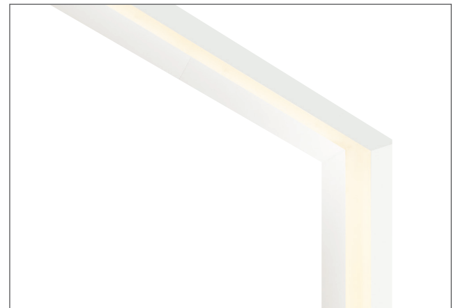
MERGE shown flangeless