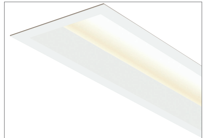
MERGE shown flanged