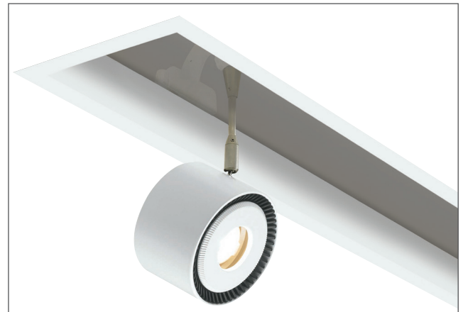
MERGE shown flanged

Notes: Typical max run length is 40' for the low-voltage bus which can be powered from both sides for a total of 80'; system wattage will impact max run length