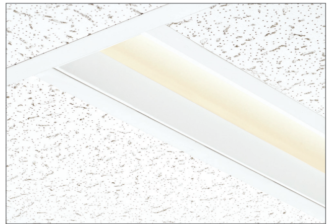
MERGE shown lay-in