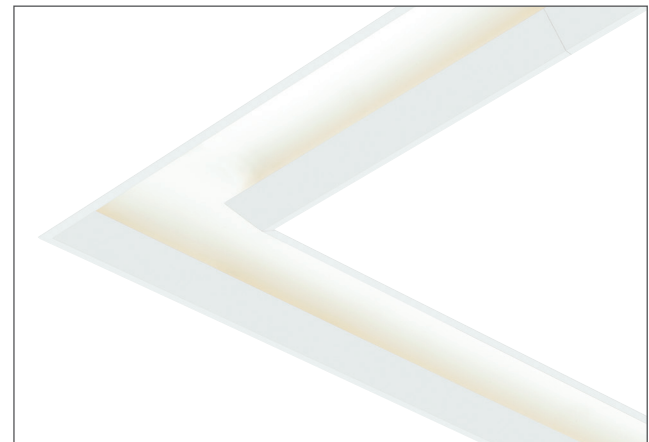
MERGE shown flanged